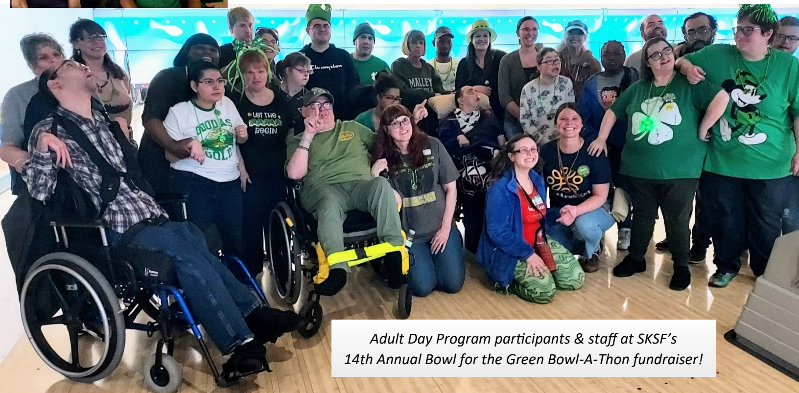
Adult Day Program participants & staff at SKSF's 14th Annual Bowl for the Green Bowl-A-Thon fundraiser!